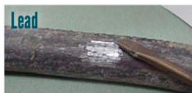
You have a lead pipe if...

If you have questions please email the Engineering Department at engineering@hhoh.org or by calling City Hall at (937) 233-1423.