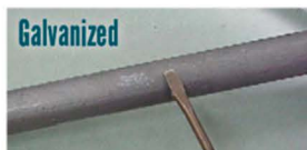
You have a galvanized pipe if...

The Magnet Test ...the magnet will not stick to the pipe.